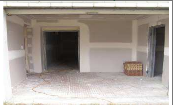
Rear entrance facing training area ahead