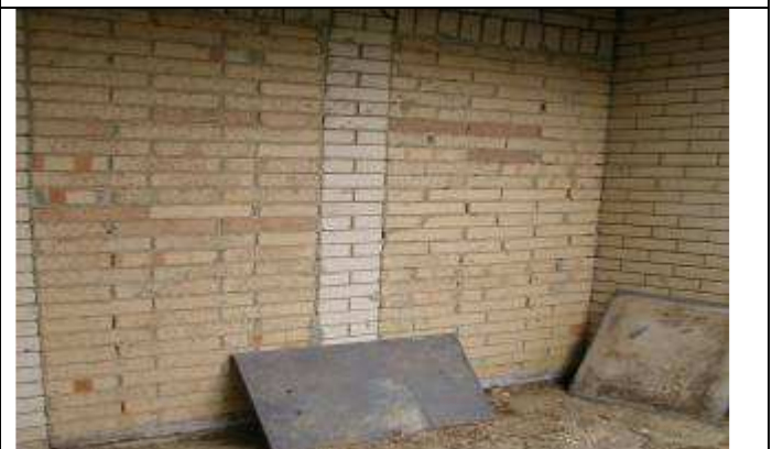
Patio walls sealed and prepared for rendering