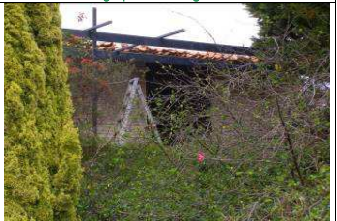
View of patio construction from below