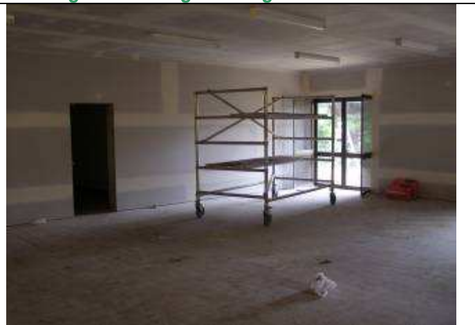
Training Area South West