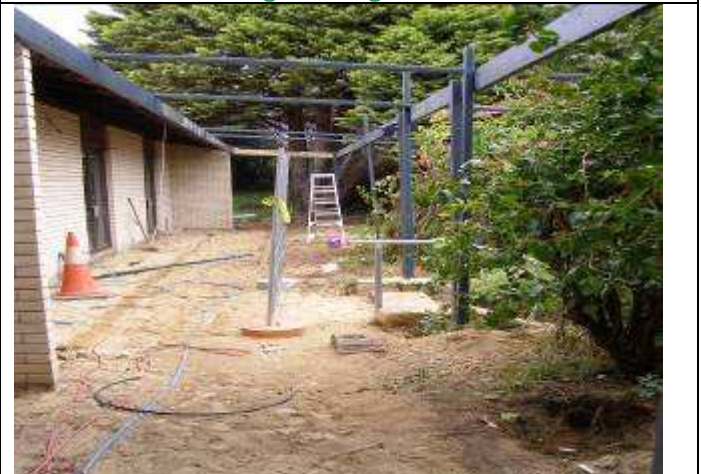
Patio under construction