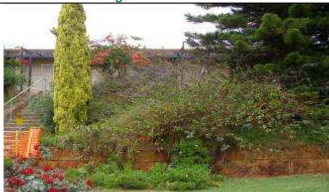
Building view from office below