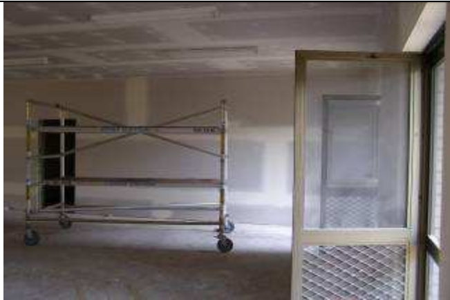
Training Area Walls and Ceiling South