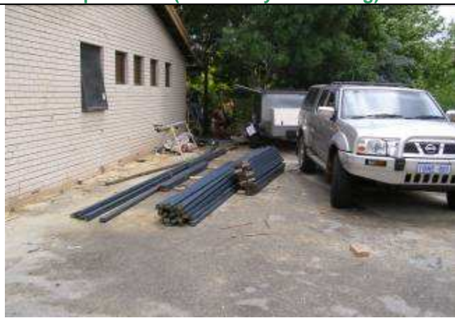
External side wall at rear of building