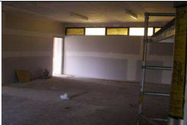
Training Area Walls and Ceiling North East