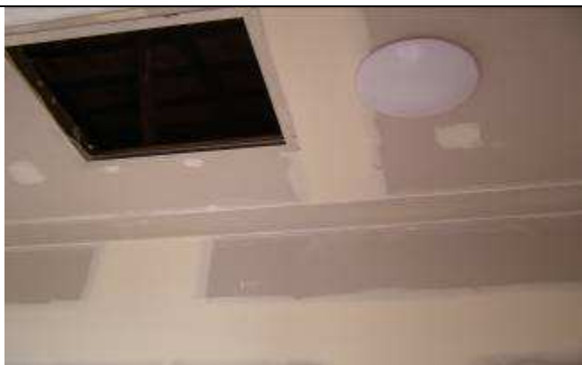
Rear store room ceiling