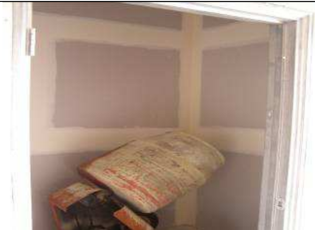
Rear entrance store room in use