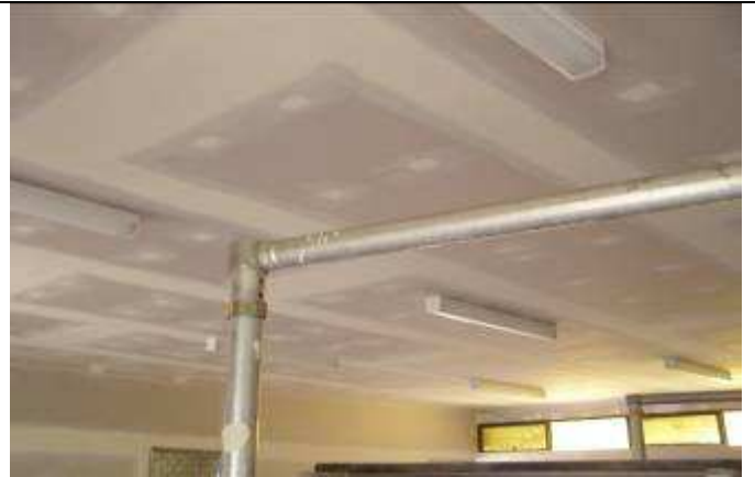
Training Area Ceilings and Lights