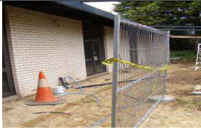
External patio wall (main entry to building)