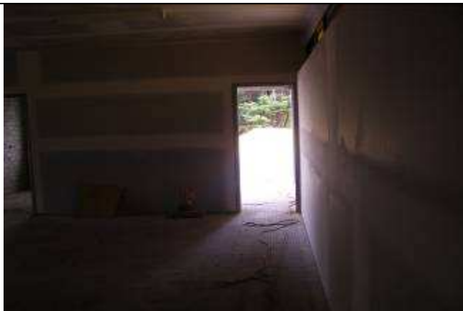
Training Area view to rear entrance