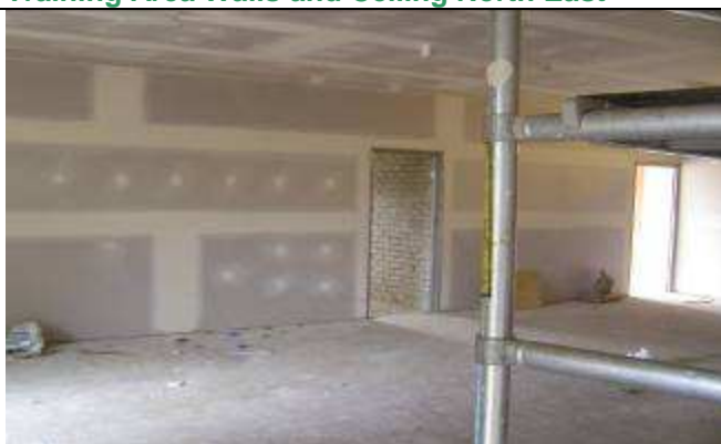
Training Area Walls and Ceiling North to Kitchen