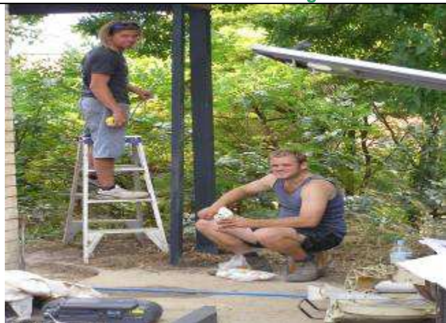
Contractors taking their lunch break