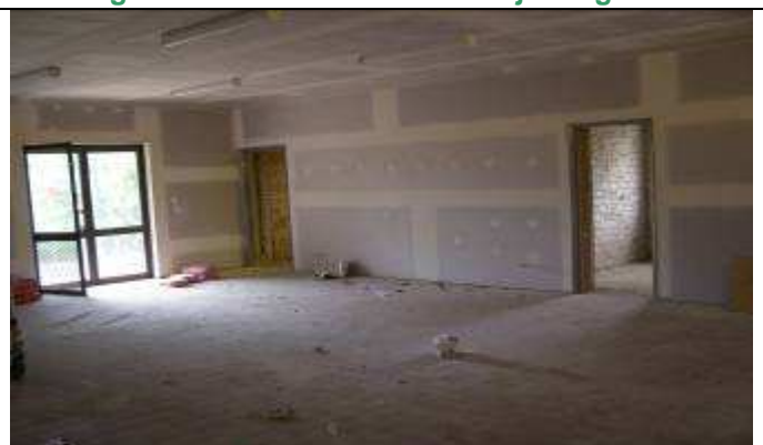
Training Area, Disabled Wash Closet at end