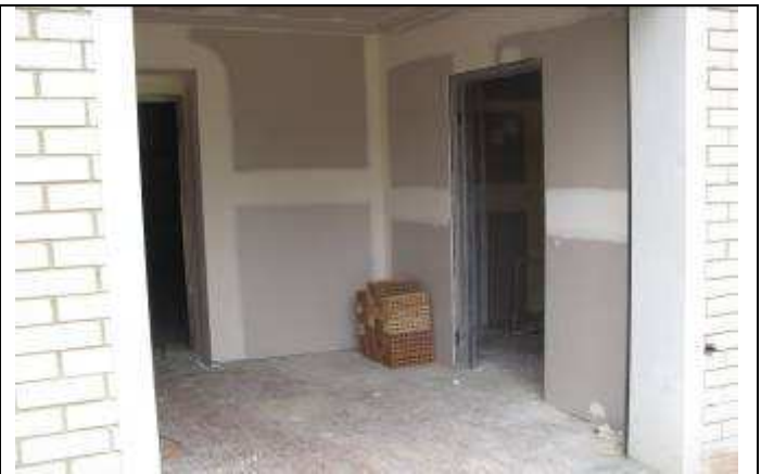
Rear entrance from outside building