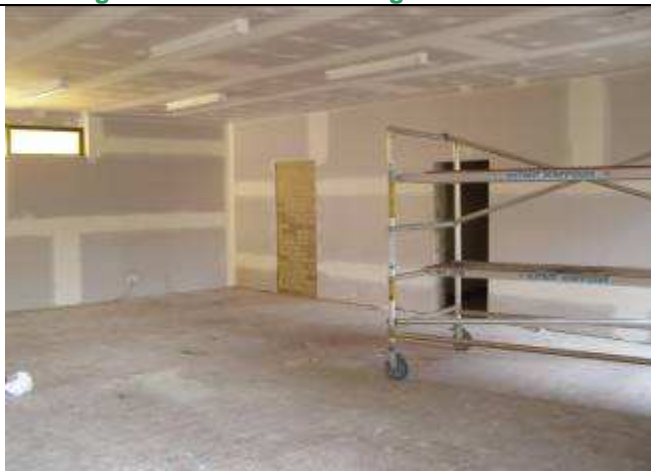
Training Area Walls and Ceiling South East