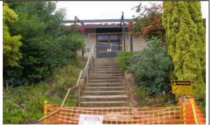
Staircase leading up to Training Area