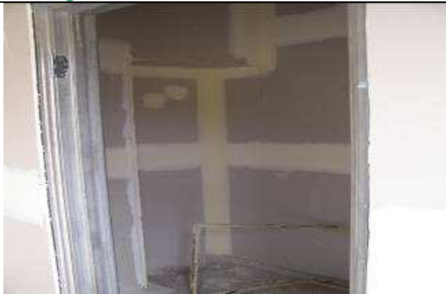
Rear entrance store room walls