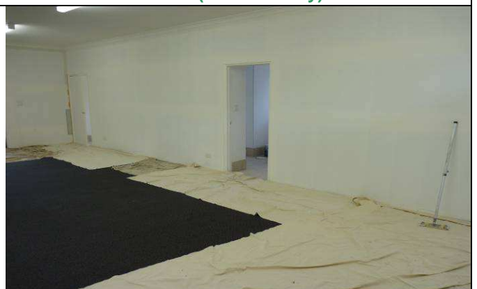
Internal painting in progress.