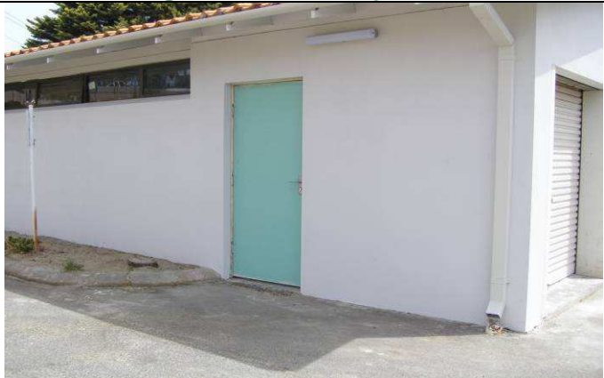
New external door fitted.