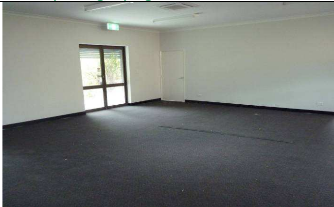
Internal painting completed (view to entry – right)