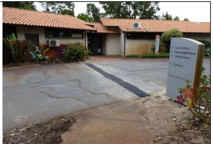
Boronia from training facility trench completed