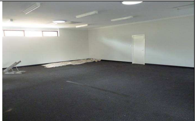
Internal painting completed (view from entry)