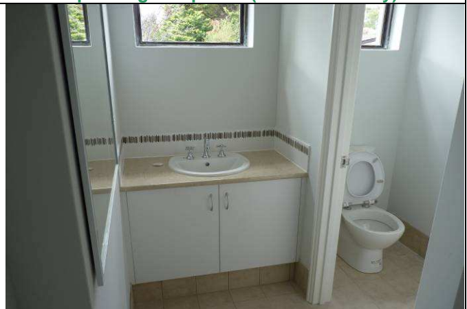
Wash closet annex to kitchen completed.