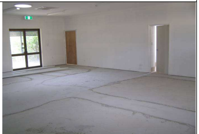
Internal floor levelled (view to entry).