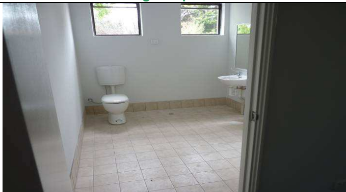
Wash closet for disabled completed.