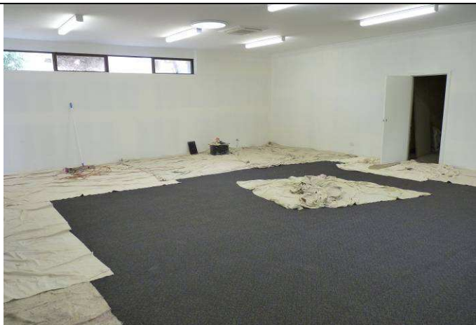
Internal painting in progress.