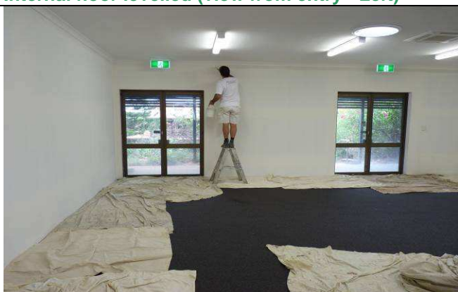
New carpet laid and internal painting started.