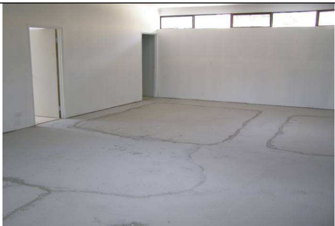
Internal floor levelled (view from entry - Left)