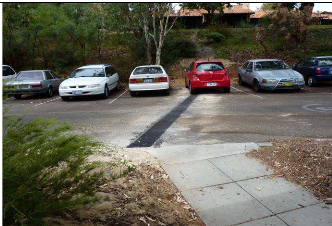
Admin building trench work completed