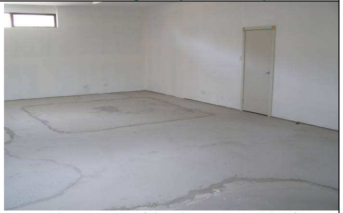
Internal floor levelled (view from entry – Right).