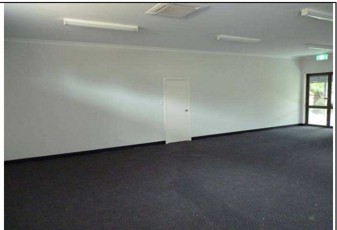
Internal painting completed (view to entry left)