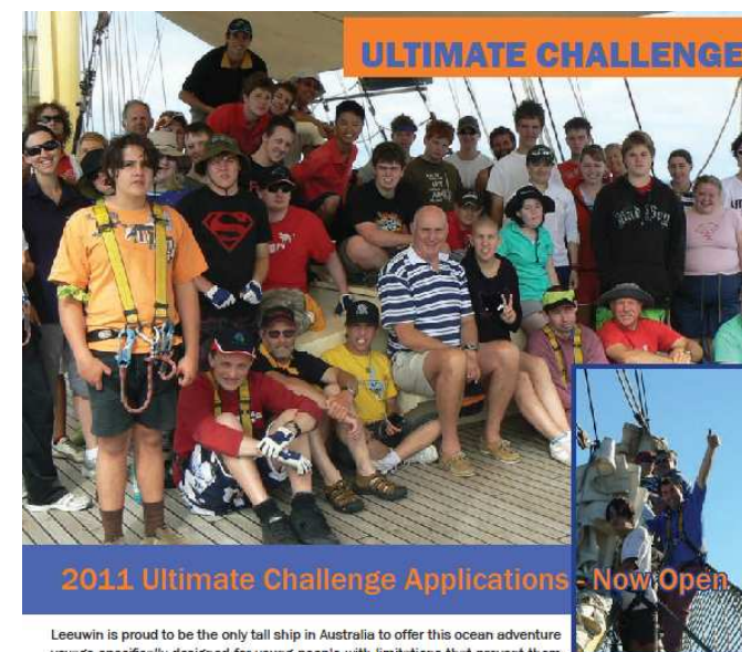
2011 Ultimate Challenge Applications - Now Open